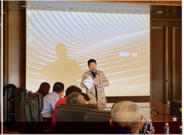
2014 APEC 2017